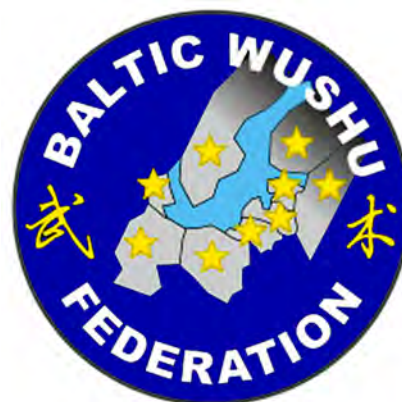
The official emblem of Baltic Wushu Federation.