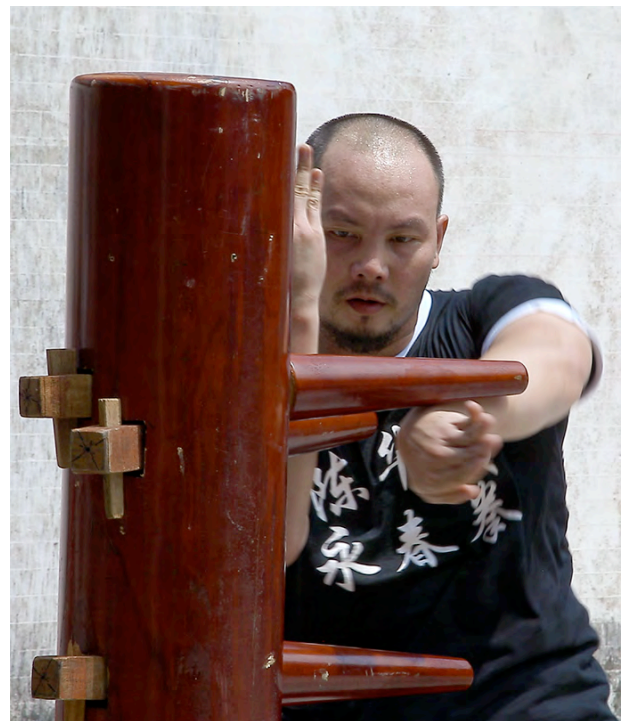
The wooden dummy became known due to the growing Wing Chun popularity. This training tool exists in many wushu schools, but it was Bruce Lee who made it known to the western World.

During more than 40 years this style of wushu evolved in the shade of Bruce Lee's master Yip Man (Ye Wen in putonghua), who was considered to be the spiritual heir and the last holder of a genuine Wing Chun tradition. In this