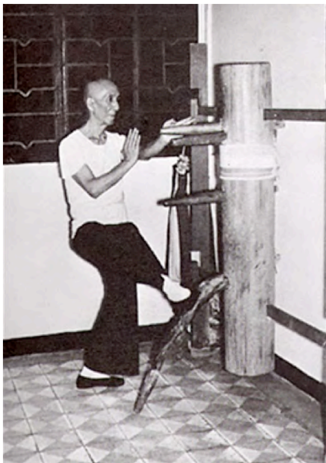
Ye Wen practicing with wooden dummy.