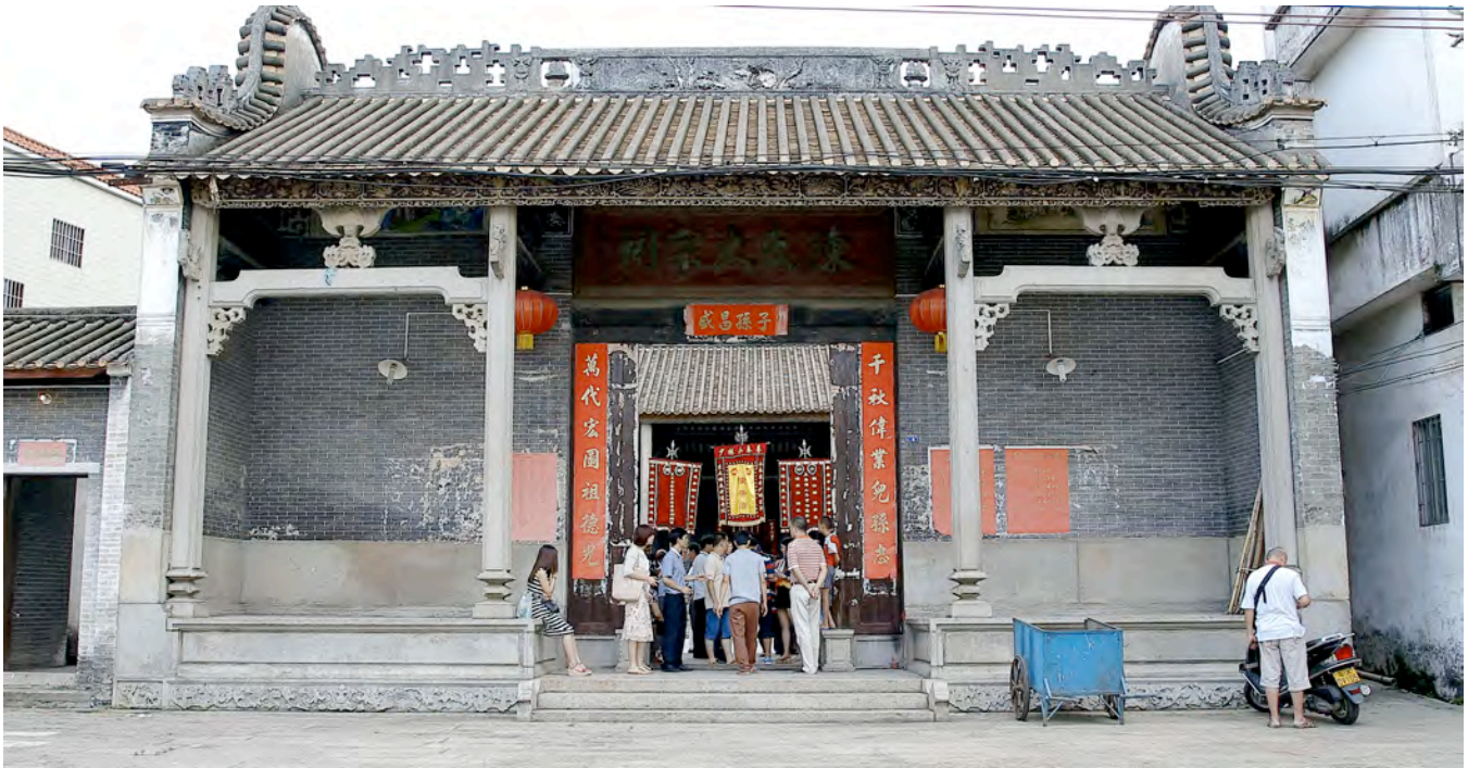
The main training hall of Chen Huashun's Yongchunquan school is still in Shunde district of Foshan.