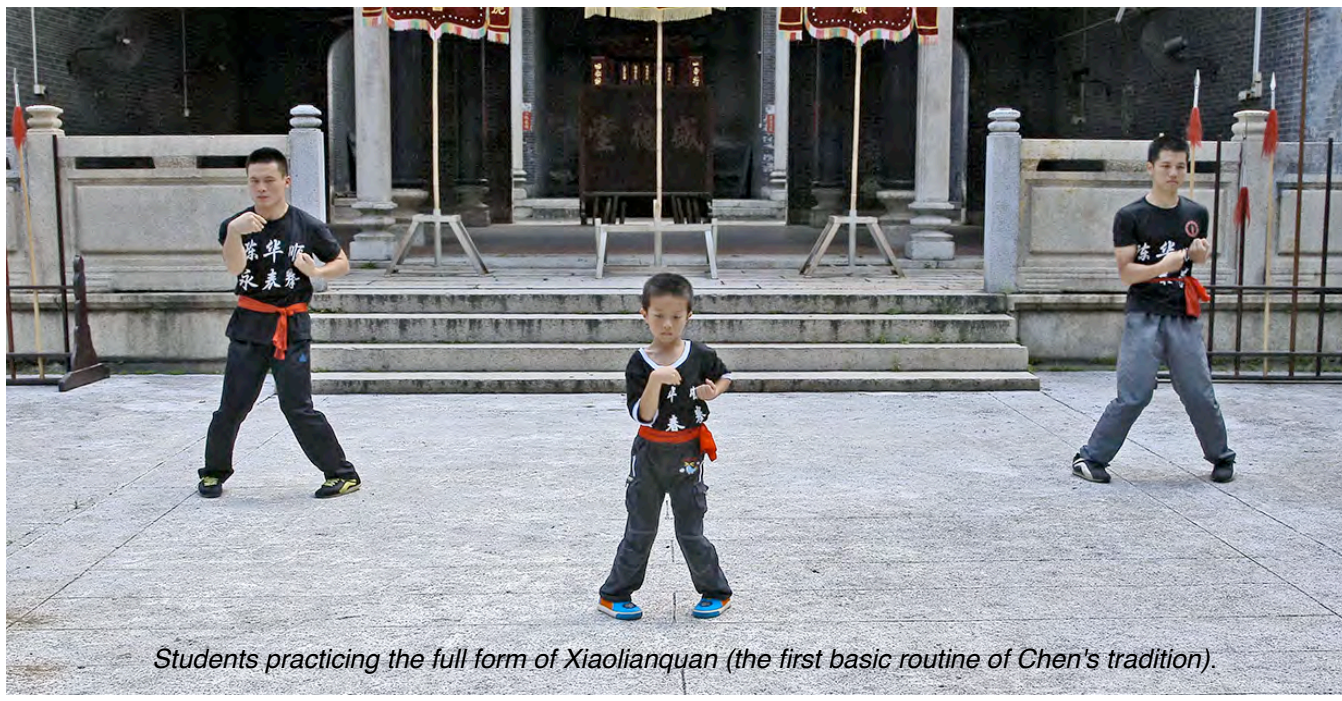
Students practicing the full form of Xiaolianquan (the first basic routine of Chen's tradition).