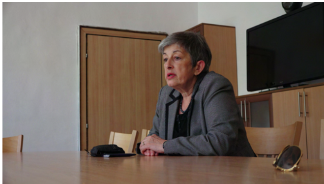
Presidents travelled to Stara Zagora in Bulgaria, the venue for our 2015 Championships.