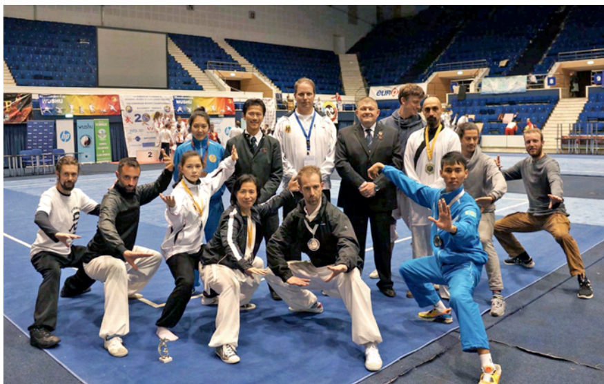
German team has won a lot of gold and silver medals showing great mastery in internal arts and Taijiquan.

standards of participants and officials. Not one appeal was made against the judge's decisions. We attribute this to the courses run by our Technical Committee to educate the officials to have a better understanding of the rules and expectations of such events.